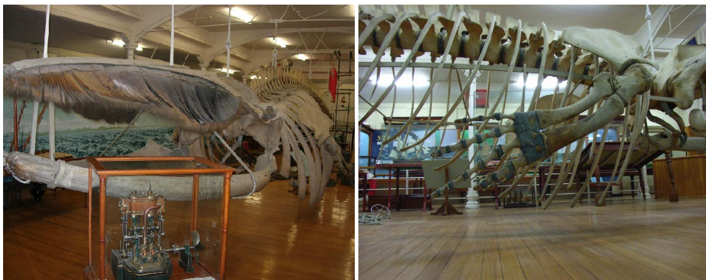
Fig. #F1: The skeleton of a baleen-whale exhibited for a public viewing in the museum from Dunedin, New Zealand. The evidence and logical deductions presented on this web page document, that out of all creatures which populate the Earth, just whales and dolphins, NOT monkeys, after thorough research will prove one day to be the closest relatives of the man. (Probably it is for this reason that in recent years such countries as Japan, Norway, and Island, do not spare resources nor efforts to be officially allowed to hunt down and to eat these still alive relatives of humans.)

Fig. #F1a (left): A photograph of the entire skeleton taken from the direction of the head. In this skeleton it is worth to look at bones of the front left flipper visible on side of the above skeleton just behind the end of head of the whale, where it sticks out from almost a human-like shoulder blade. A side view of this left front flipper is shown on the photograph (b).