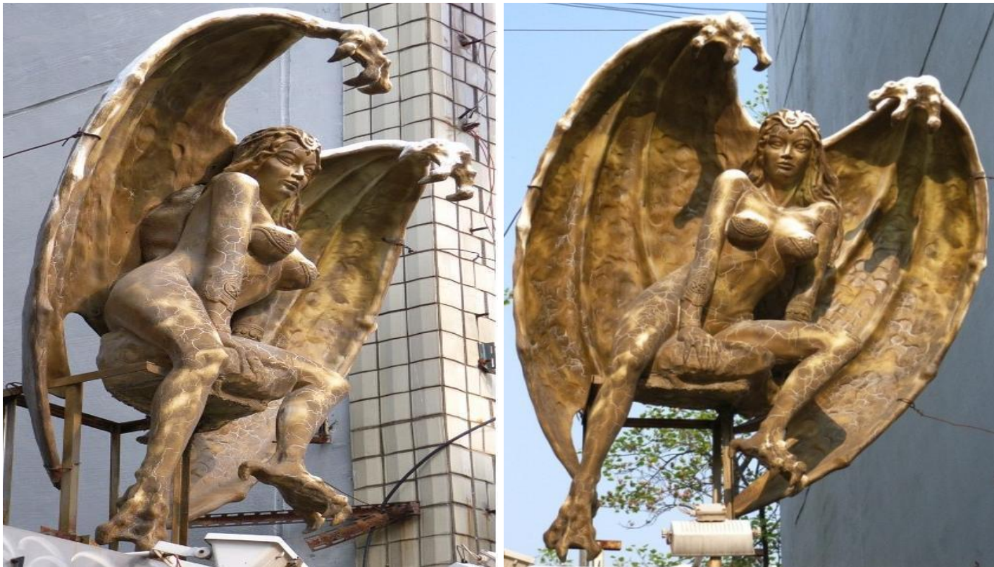
Fig. #K2: Genetically engineered mutant which supposedly is a result of short-sighted genetic experiments of UFO-nauts. It represents genetically mutated monster which is a cross between a human with genes of selected animals. For example his hands and fots are replaced with paws of a lizard of pray - perhaps from a version of crocodile or comodo dragons. Practically in all cultures of the world this creature is known as a "devil with cock's claws" - as an example I suggest to recall the poem "Pani Twardowska" of the Polish poet named Adam Mickiewicz "... chicken legs and cock's claws he had. ..." On the above sculpture reflected is a "female version" of this "devil". In order to allow a better

while from the belt downward had the appearance of goats. To their examples belong, amongst others, "hoofed devils" widely known in the medieval times, and also "satyrs" from the ancient Greek. The ancient Greek knows also the goat-footed god "Pan". In turn horned monsters include, amongst others, medieval horned devils. Furthermore, horned was also the German god Wotan, and the god of Vikings named Odin which travelled on the "flying horse" called Sleipnir (a UFO vehicle?). Horns had also Moses (the one which took Israelis from Egypt) - which the fact is immortalized even on the sculpture of Michael Angelo "Moses" (to be seen in the church San Pietro in Vincoli in Rome). Furthermore, on one English documentary film about Alexander the Great it was claimed that this Macedonian monarch also had small horns - the fact of which is supposedly recorded even in Koran. (Such information induces in us a question, who actually was Moses and Alexander the Great - i.e. were they horned versions of present UFO-nauts-changelings .) Every place on the Earth knows further mutated monsters of a partial characteristics of a human. However, all of them were just clumsy monsters. UFO-nauts are simulated as being too stupid to successfully play God!