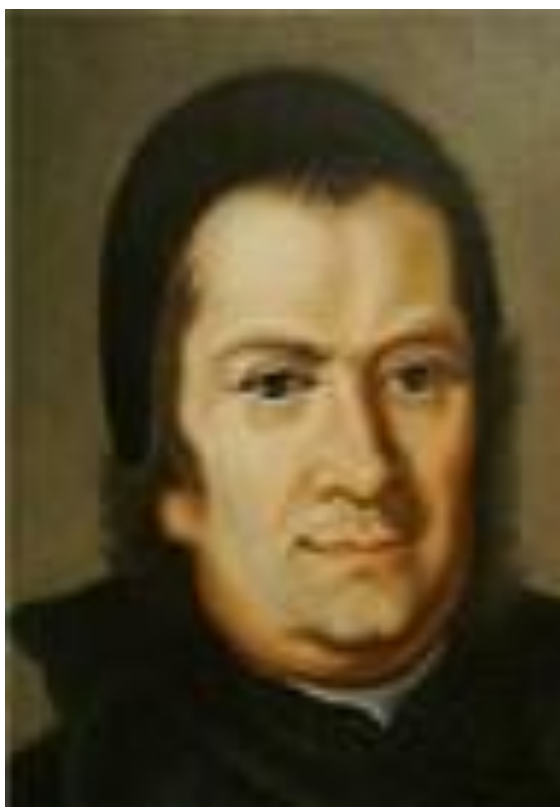
Fig. #G5: The face of a typical male UFO naut.

The face of a historic figure shown on the above photograph is very similar to a typical face of UFO nauts that are known to me in person, and that operate on Earth as cosmic spies and saboteurs. The only thing that differs slightly from my own observations is the shape of nose. UFO nauts which I know in person have much longer noses that gradually narrow down towards the sharp end, and that finish with a kind of a small groove running between two cartilage plates that form the sharp end of the nose. Actually their long noses for me resembled uniformly narrowing carrots with sharp ends.