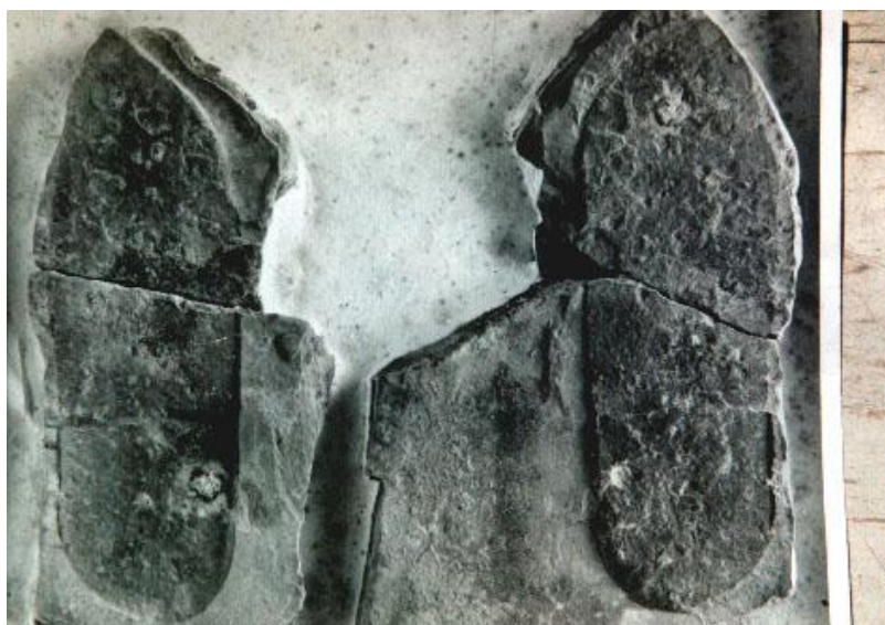
Fig. #E1: (originally Fig. P31 in monograph [1/4]). It presents an imprint of UFOonaut's shoe 550 millions years old. So already then UFOonauts supposed to be enough advanced to NOT only be able to fly to the Earth from distant star systems, but also were able to initiate the life on our planet.

without putting any work into them. These morally degenerated relatives of humanity were the ones, who actually settled people on Earth, in order to be able to ruthlessly exploit us later. An alternative history of humanity, which describes the fate of our civilization that emerges from recent research on UFOs, is presented in subsection V3 from volume 16 of monograph [1/4] "Advanced Magnetic Devices", and in subsection E7.4 from volume 4 of monograph [8] "Totalizm". If someone ask us whether there is any material evidence that UFOonauts are actually our close relatives who are around 600 millions years older from us, then apart from the above subsections V3 and E7.4 in [1/4] and [8], he/she should also look at Figure O32 in monograph [1/4], or at Figure B1 in treatise [7/2], or at Figure E2 in monograph [8]. These Figures show a photograph of an imprint left rock that was made by a shoe of an UFOonaut. This imprint is around 550 millions years old. This shoe was imprinted on Earth, when ancestors of the present UFOonauts started to spread the first forms of life on our planet, in order to gradually prepare it for the arrival of people, whom they could later exploit forever.